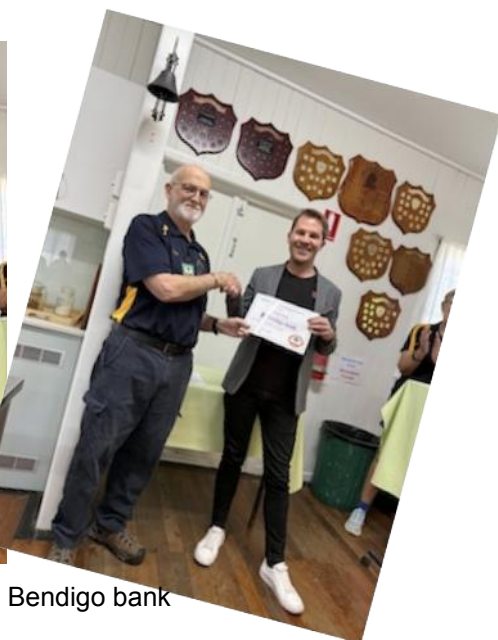
L to R Woolworths, City of Moreton Bay and Bendigo bank