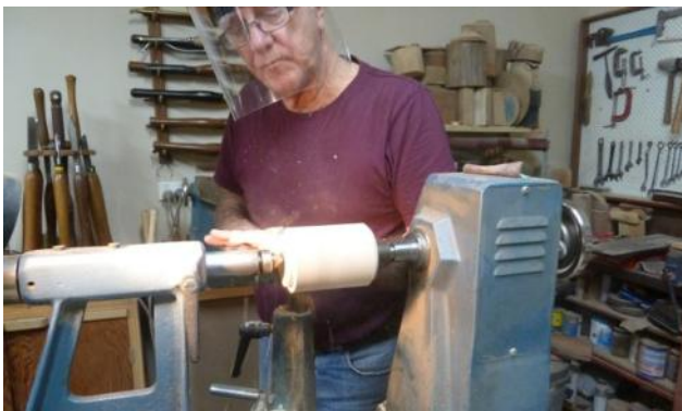
3. Turning off the pegs.