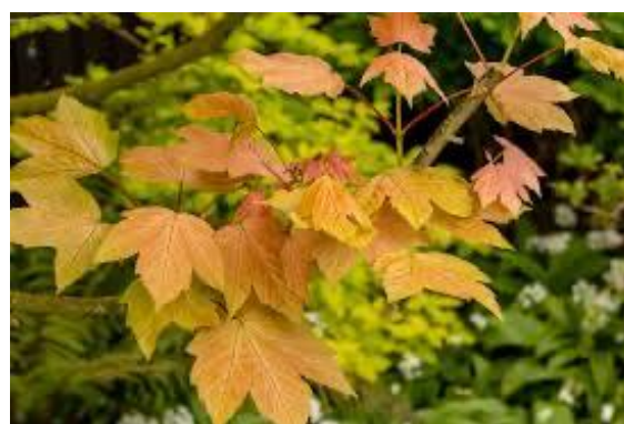
Foliage in Autumn