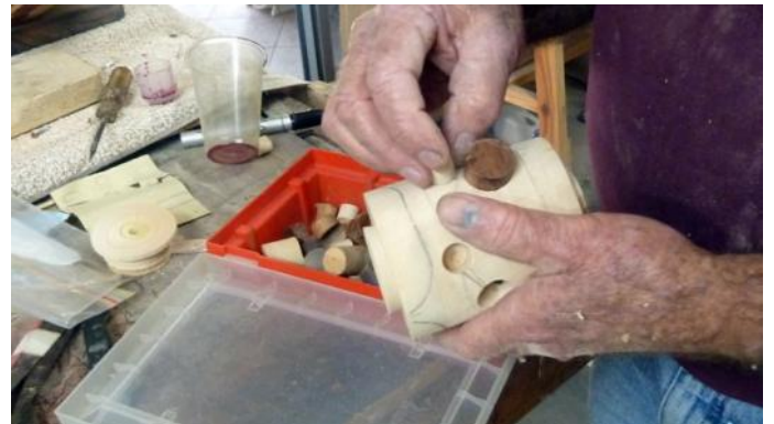
2. Pre-cut plugs of various species are inserted.