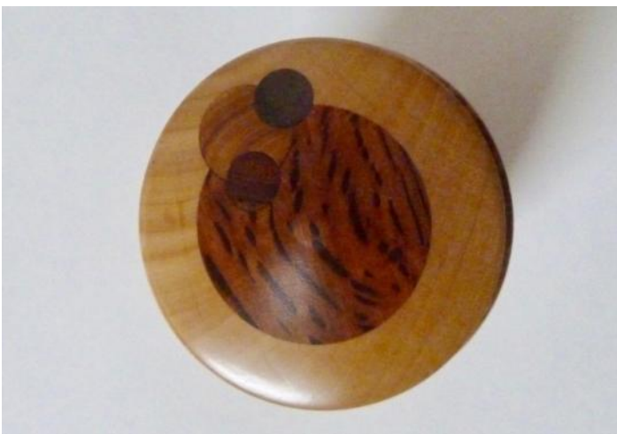
9. some extra plugs were also inserted in the lid to correspond with the body.