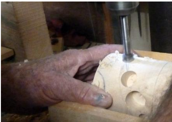
1. Holes were drilled with a Forstner bit.