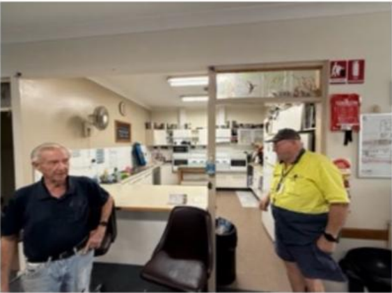
Rec Room and Kitchen: