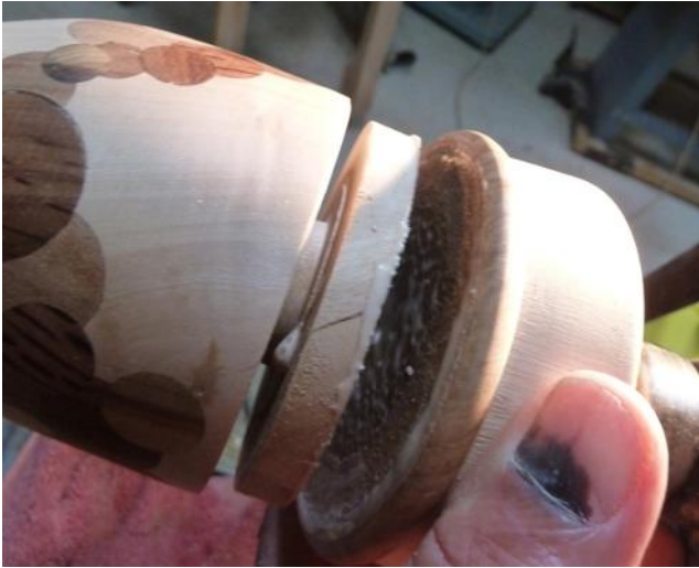
5. Gluing on the 'collared' lid before turning out the box to expose the plugs on the inside.