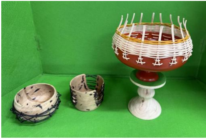
A close up of Michael's Wood and Cane creations.