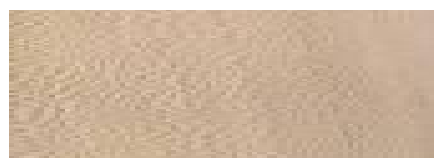
A bland representative Sycamore grain