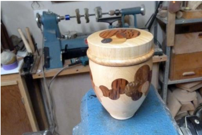
7. The completed box prior to the shaping of the base.