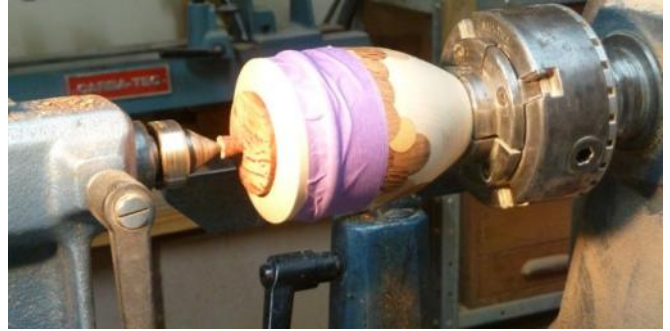
6. The box has its lid taped back on for turning and further drilling and inserting of additional plugs.