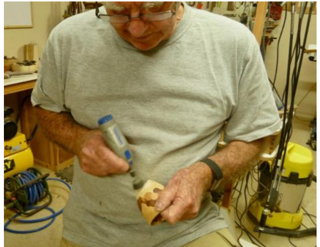
8. Three small feet were carved out on the base using the Dremel before finishing the box in a satin lacquer.