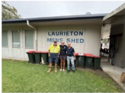
Workshops (check out the extraction system):