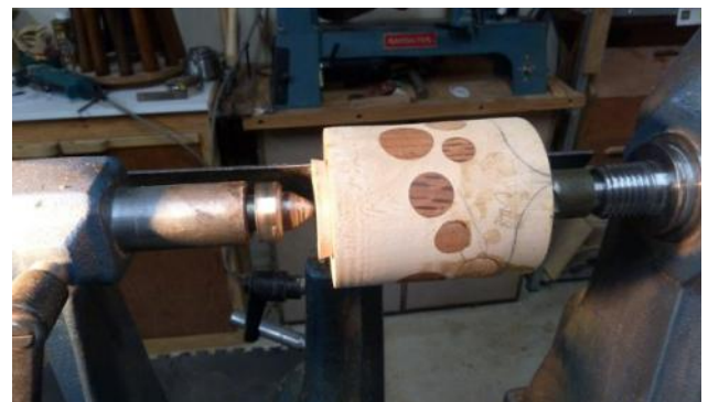
4. The blank is now ready for final shaping